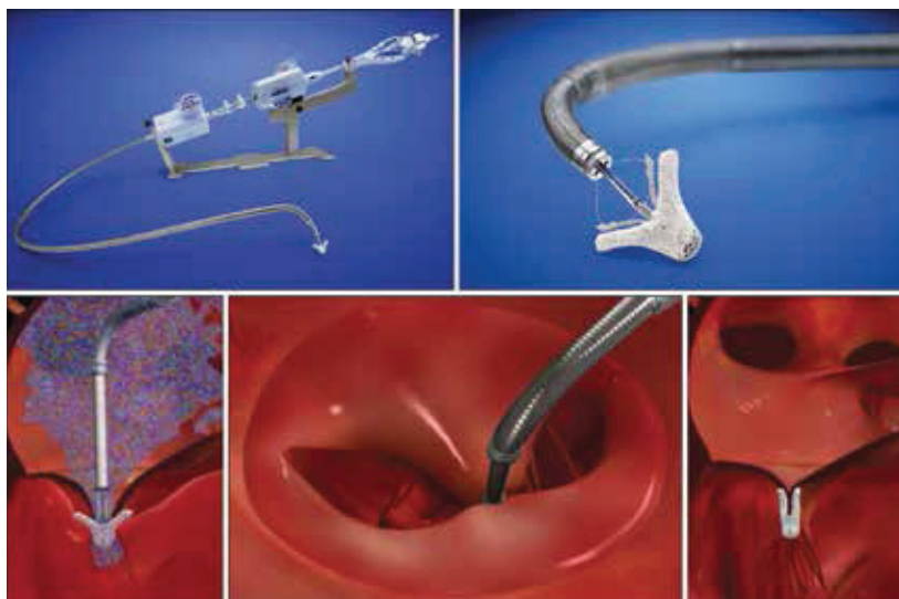
Figure 2 The MitraClip transcatheter mitral valve repair system allows for edge-to-edge mitral valve repair through a percutaneous non-surgical approach from the femoral vein.